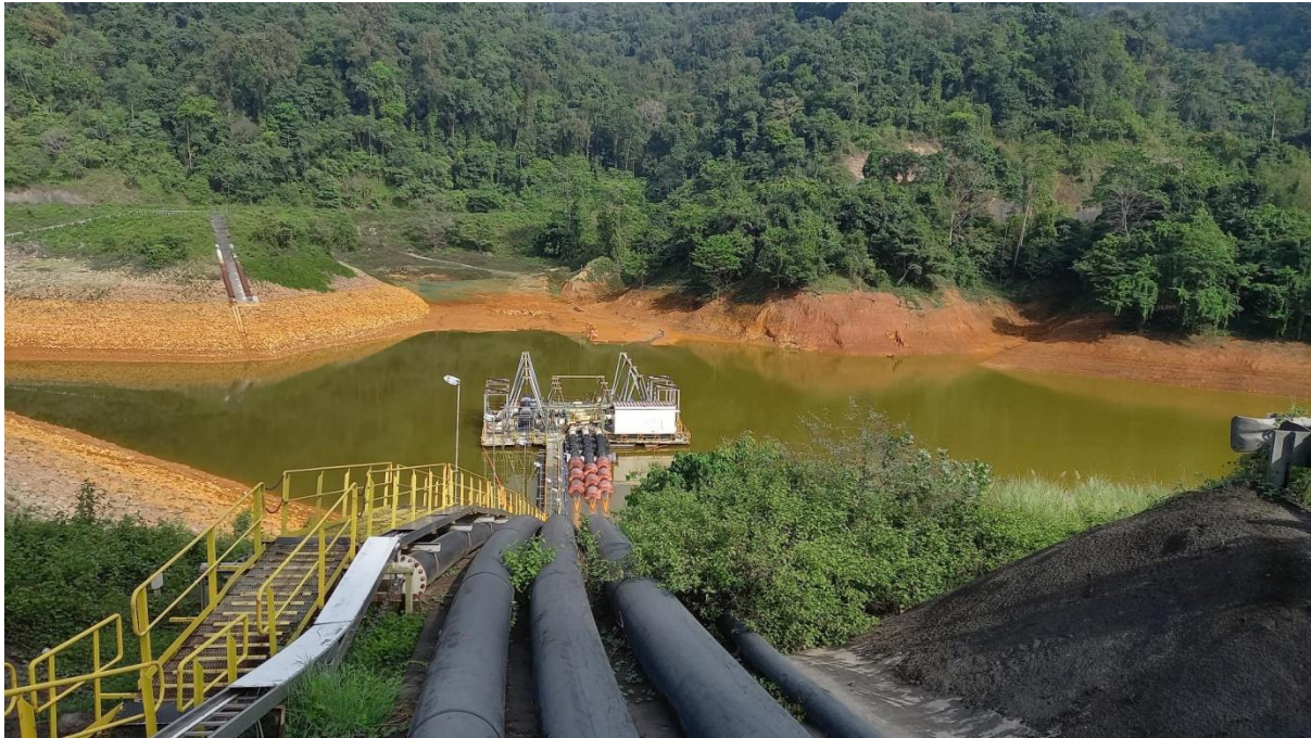
Image 7. The Mining Wastewater Processing Location at SPS Santong 3 [9]

This initiative has also supported water efficiency initiatives by saving groundwater usage. This initiative promotes sustainable development goal number (12), Responsible Consumption and Production.