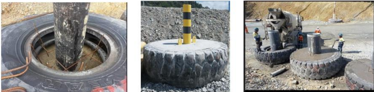
Image 6. Utilization of Used Tyre as Movable Electric Poles Application

The term “used tire” refers to Hauling Truck tires which have already expired, generally after being used for 2,500 hours, or equal to 3.5 months of operation. After turning into a non-toxic and hazardous solid waste, commonly used tires idle in a waste rock dump, thus not being utilized well. Currently, however, the company has come up with innovative ways to utilize used tires as a hardening material to make portable electric poles. The activity is documented in Image 6.