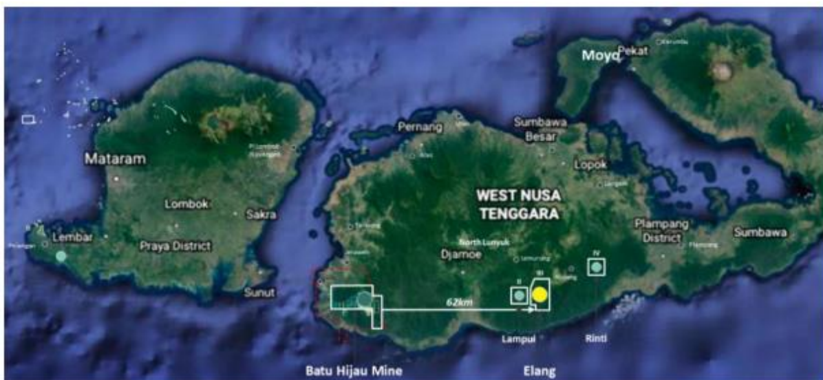
Image 1. AMMAN's location in the Batu Hijau site, West Sumbawa Regency [1]

Amman Mineral Nusa Tenggara – AMMAN (previously operated by Newmont Nusa Tenggara), is a mineral company that manages copper and gold concentrate mining activities. AMMAN operates in the Batu Hijau mining site, 27 kilometers from the Sumbawa Barat regency capital in Taliwang, West Nusa Tenggara (see Image 1). The Batu Hijau mining site has been operating for the last 22 years and has contributed significantly to the development of the Sumbawa Barat regency and its surrounding areas, which in the end also contributes to national development. Throughout its career, AMMAN has committed itself to always incorporating elements of sustainable energy, environment, and community management into its operational activities in order to leave its best legacy for Indonesia.