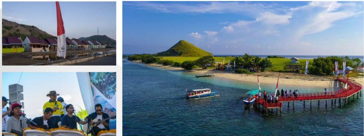
Image 11. Pilot Community Empowerment Projects

This program was pioneered in 2022 and will continue to be developed in the future. Until today, the Gili Balu management has received lots of support from the local tourism industry task force and business players. The Pototano village administration and the local fishermen also play a crucial role in making this program possible [13]. This activity supports sustainable development goals (1) No Poverty, (2) Zero Hunger, (6) Good Health and well-being, (8) Decent Work and Economic Growth, (12) Responsible Consumption and Production, (13) Climate Action, (14) Life below Water, (15) Life on Land, and (17) Partnerships for the Goals.