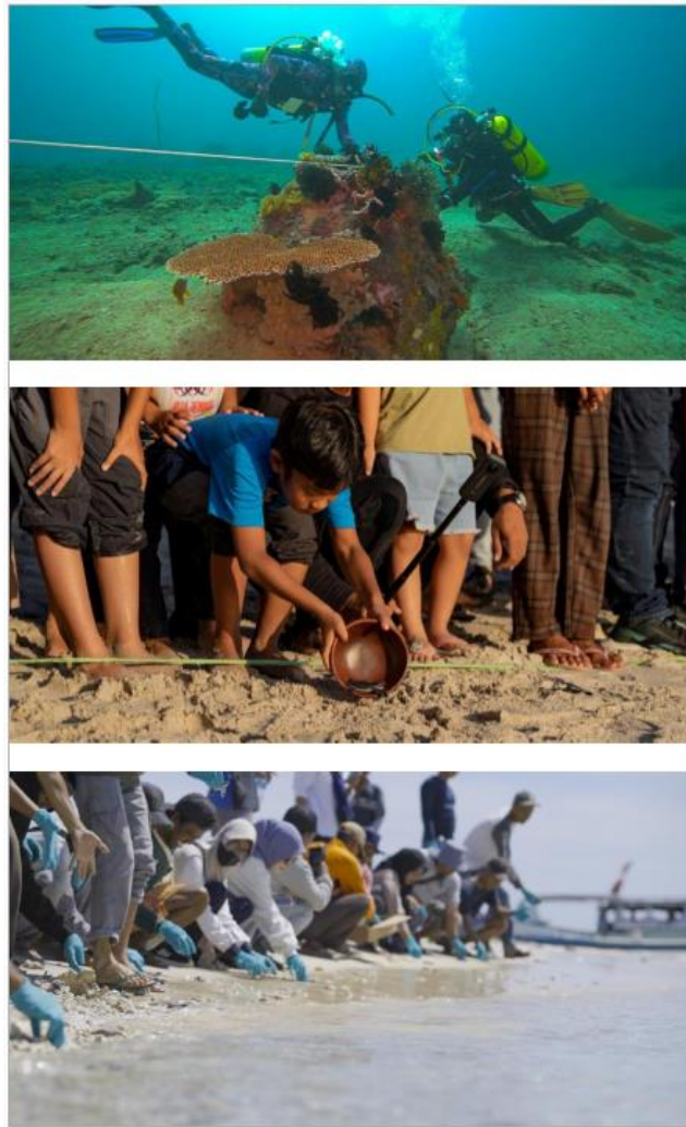
Image 10. Reef and Green Turtle conservation on the Kenawa Island

To date, about 5,000 green turtles have been released in West Sumbawa Regency as part of a biodiversity program managed by AMMAN [12]. This program also supports Sustainable Development Goals number (13) Climate Action, (14) Life below Water, and (15) Life on Land.