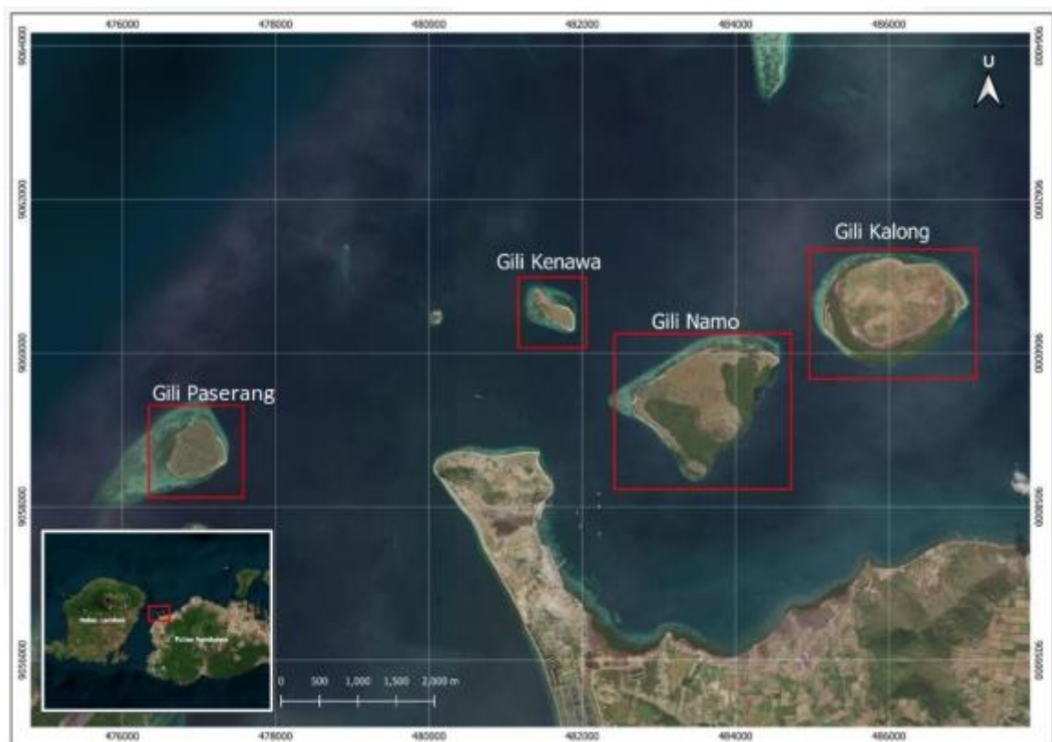
Image 9. The Kenawa Island and the Gili Balu Conservation Area [11]

The conservation activities conducted on Kenawa Island include deploying and monitoring artificial reefs and releasing the green turtle, which has been classified as endangered since 2022 by the IUCN Redlist of Threatened Species. Image 10 shows the conservation process.